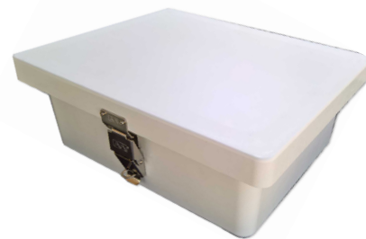
Ruggedized External Probe Enclosure