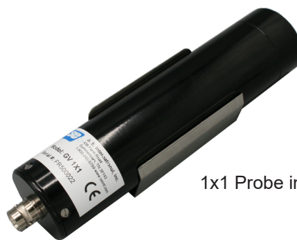
1x1 Probe in Clips